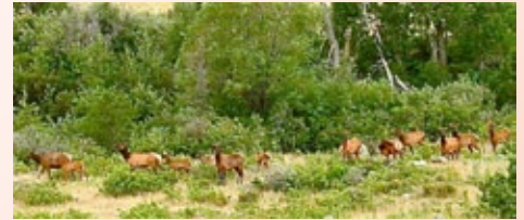
Elk herd, alive and well in the Colorado Rockies where Rocky Mnt Nt'l Park Service culled 100 elk in 2009 and are "also trying birth control." Photo: Mike Gallivan, 2012

in a position to force legislation regardless of science or popular opposition, then it becomes necessary to actively educate, to oppose prejudice with science, and to try to bridge our differences with our common love of nature, respect for interdependence of all wildlife and the need to preserve their habitats.